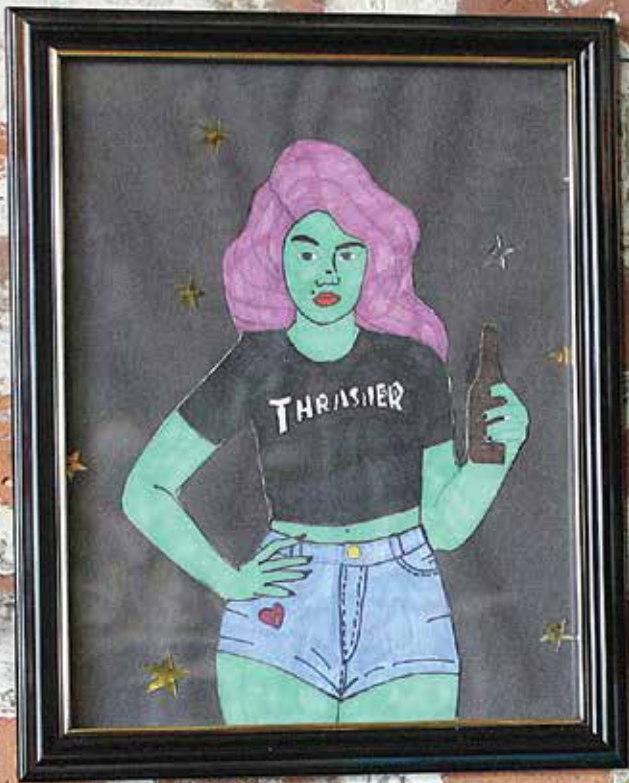
Shydae Age 1